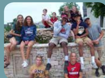
STATE TRACK - Student-athletes who competed in the state track meet.